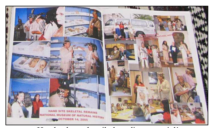
He also brought tribal reading material!